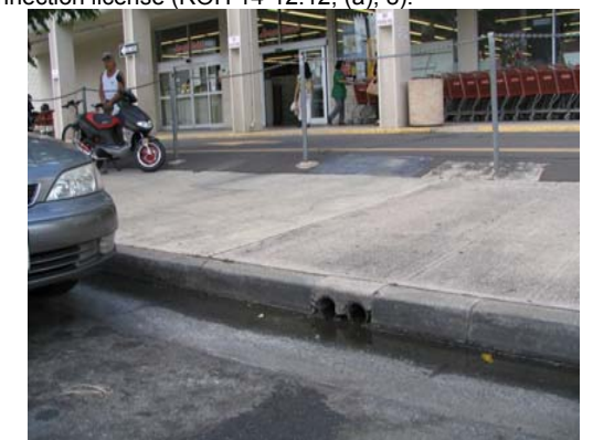
Curb drains at a business that discharged contaminated runoff to the City's street drainage system.