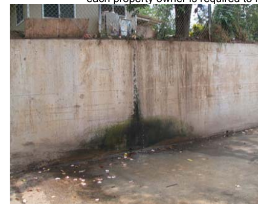
Tracing the nutrient source to a pipe from a washing machine tying into a channel, which is a part of the storm drainage system.