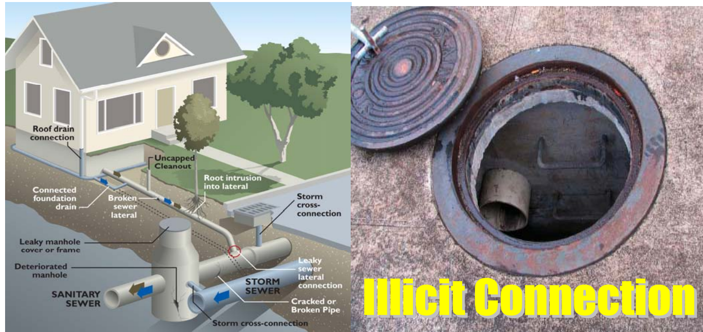
Detecting illegal cross connections between storm water drainage and sanitary sewer pipe that is below the ground, under a manhole.

The next time you are outside in the rain, take a look at what is running off your roof, yard, and driveway into storm drains. Clean rain water can quickly become a polluted dirty chemical mess as it picks up sediment, fertilizers, pesticides, oil, detergents, pet waste, grass clippings and more. You are looking at a major cause of water pollution in our streams and coastal areas, threatening our fish and wildlife, fragile ecosystems, public health and causing the loss of recreational and aesthetic value; this is urban runoff. Revised Ordinances of Honolulu make it unlawful to connect any pipe or device to the municipal separate storm sewer system or MS4 that is intended to discard, spill or dump any material other than storm water runoff or ground water (sump pumps) into the system.