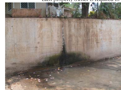
Tracing the nutrient source to a pipe from washing machine tying into a channel, which is a part of the storm drainage system.