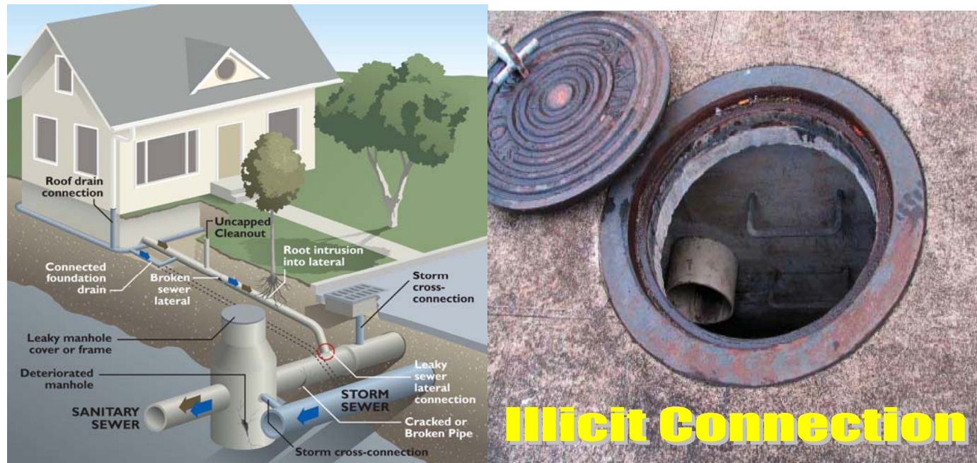
Detecting illegal cross connections between storm water drainage and sanitary sewer pipe that is below the ground, under a manhole.

When it rains, water flows over streets and yards carrying the pollutants it picks up into storm drains. The storm drainage system, unlike the sewer system, does not treat runoff that carries pollutants to streams and ultimately the ocean. More specifically, private storm drain connections to the City-owned MS4 discharge pollutants, such as automobile fluids, sediment, and leaves into state waters directly or by conveyance through a drainage facility. This can create a water pollution problem. It can also be a nuisance or hazard.