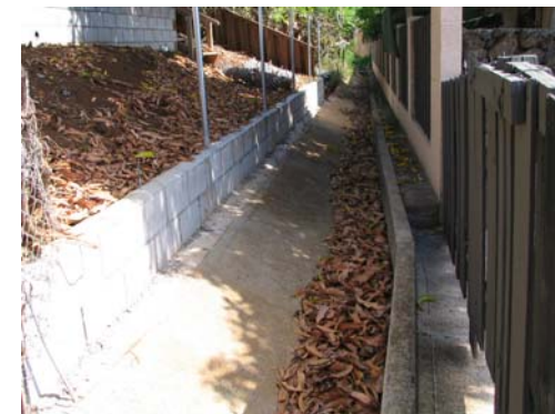
Where a private drainage system is common to one or more parcels and is owned by more than one property owner, each property owner is required to have a private drain connection license (ROH 14-12.12, (a), 8).

Some Illicit Connections at residential sites are addressed through complaints that have been filed or visual inspections by City staff. Inspectors walk a drainage area to identify Illicit Connections that could contribute pollution to the storm drain system via surface runoff. Below are some common problems.