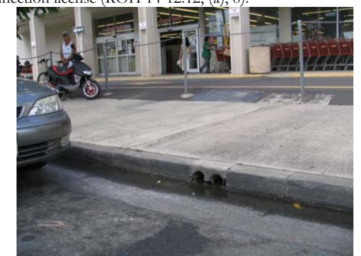
Curb drains at a business that discharged contaminated runoff to the City's street drainage system.