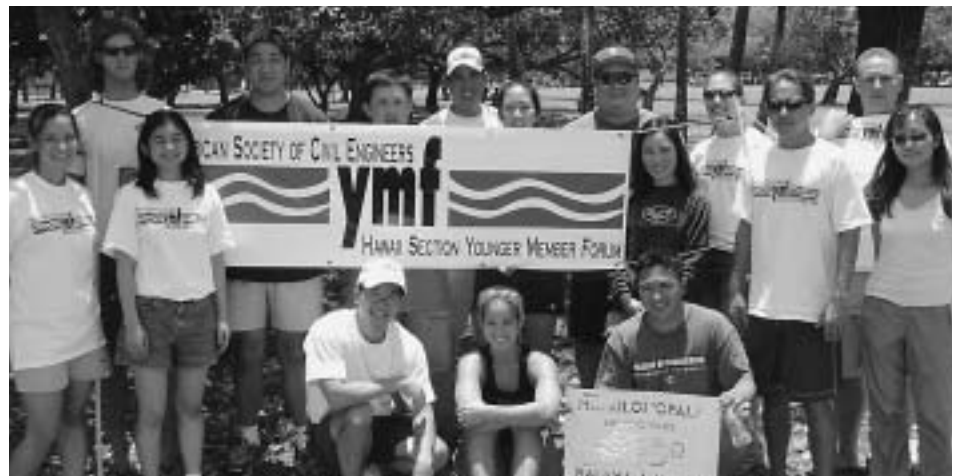
The Hawaii Section YMF and University of Hawaii storm drain stenciling volunteers.}